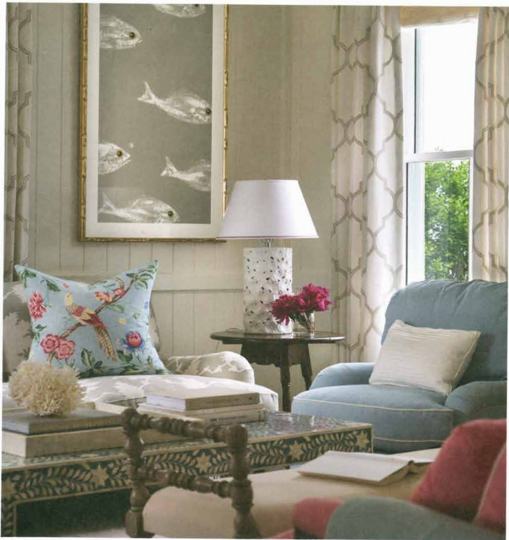
Above: An inlay coffee table by Mix Furniture is paired with classic upholstery from O. Henry House and a whimsical lamp from Visual Comfort. Opposite: 1 The entry hall. 2 The original house is connected by an underground tunnel to the guest cottage. 3 Steven King's Kool Aid Stripe area rug, upholstery by O. Henry House, and casegoods by Sterling round up the selections in this much-loved family room. 4 In the kitchen, an antique whaling harpoon was outfitted into a custom chandelier by the master craftsmen at Paul Ferrante. It was paired with pendants from Ironware International and a dining set by New Classics.